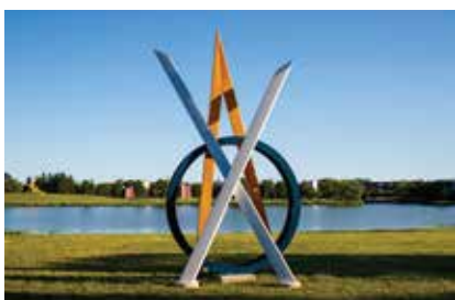
Stargazing with Contrails

With the addition of “Sound of the Woods” , and through the siting of it across the lake and around the bend from “Stargazing with Contrails” by Terry Karpowicz, the visitor’s experience deepens and expands because of the sequence of artworks, contrasts of materials, themes, scale, texture, color, and form. The visitor approaches “Sound of the Woods” within the context of the other masterworks of theNate, with their stories echoing and reverberating like nature’s melodies, like the sound of the woods.